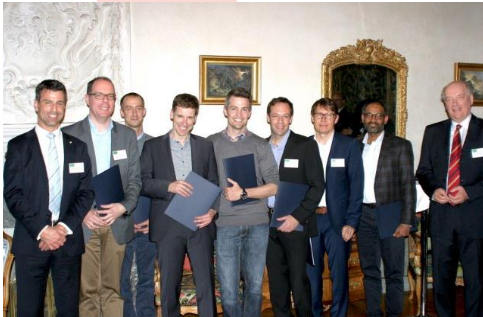
The 2017 Sandmeyer Price winning team from Roche Basel